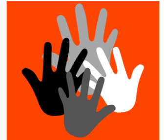
RACIAL JUSTICE & EQUALITY

Confronting hate and bridging divides by building awareness, education, and collaborative partnerships that elevate the voices of Black, Indigenous, and People of Color.