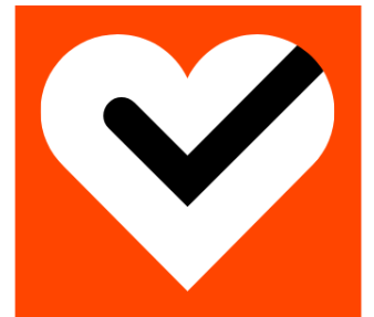
SAFETY, SUPPORT & WELLNESS

Providing services for survivors and their loved ones impacted by sexual violence. Enhancing the well-being of families, especially children and seniors by fostering social connections, offering child care and summer camp experiences.