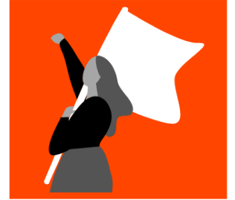
GENDER EQUITY & EMPOWERMENT

Providing tools and skill based learning for women & girls to inspire empowerment, self- advocacy, leadership development and personal authenticity.